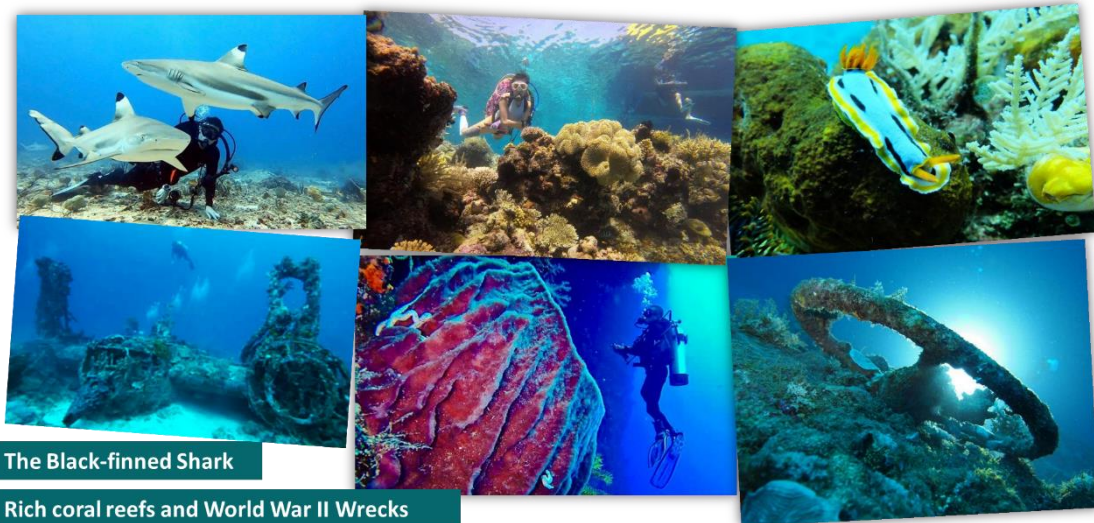
The Black-finned Shark