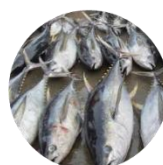
Large Pelagic Fish